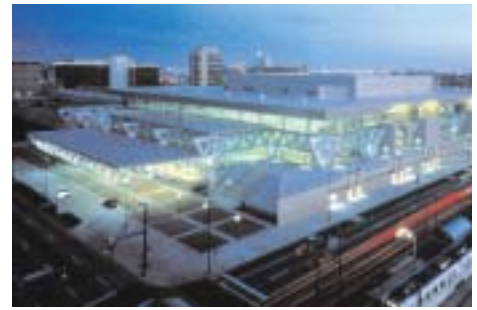
The Baltimore Convention Center is the site of this year's AAMI Annual Conference & Expo.