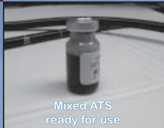
Mixed ATS ready for use

ATS is comprised of those soils clinically-used instruments are exposed to. Apply the soil to devices to simulate the contaminated condition of a patient-used instrument.